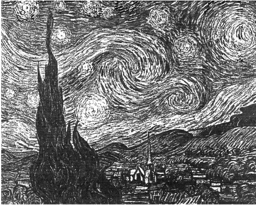
Figure 2. “Starry Night”: 1889 oil painting by Vincent Van Gogh.

It seems that the conventional form of the Hubble law might have to be modified by a certain factor introduced by a change in form of the universe in the process of expansion. This seems indeed to be rather natural for an evolution approaching a crunch state.